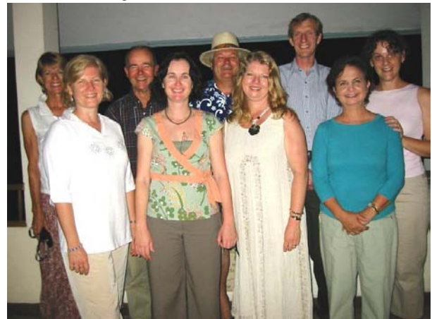
Summary of Clinical visits – 2005 (3 visits):