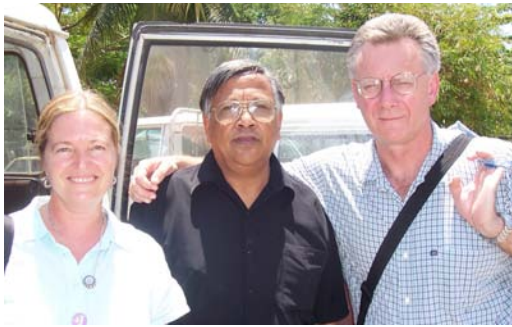
Surgical team members - Dili

Personnel involved in the visit to Timor Leste, 2005 are: