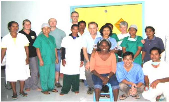
Surgical team members with local theatre staff and helpers – October 2005

As in other visits, the majority of patients consulted by the orthopaedic teams were with children with club feet and talipes, bone fractures, flexion contractures of joints, joint fixation plus other bone and joint ailments. The plastic teams saw patients whose ailments range from cleft lip and palate, burn contractures, and at last visit, a number of patients with facial tumours presented. In situations where the cases were suspicious or unsuitable for surgery at the local hospital, biopsy specimens were taken to Australia for further analysis. Some patients of this category have been sent to Surabaya for surgical treatment.