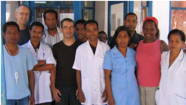
Surgical team and local theatre staff - Baucau hospital