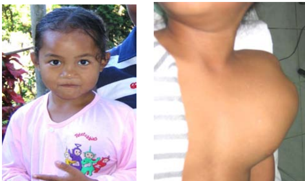
A young patient with vascular Tumour, biopsied by our team then sent to Surabaya for Surgical treatment