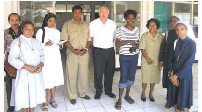
Team members with Hospital Admin staff and Nuns at Atambua hospital