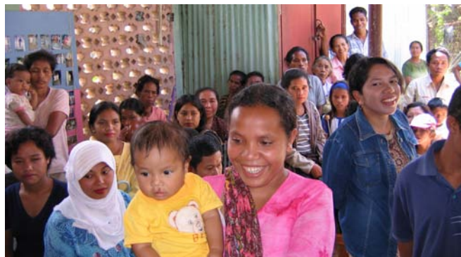
Plastic surgical patients at consultation — October 2005

Cancar: Since 2002, more than 200 cleft lip and palate patients have been assessed, 196 have had surgical treatment.